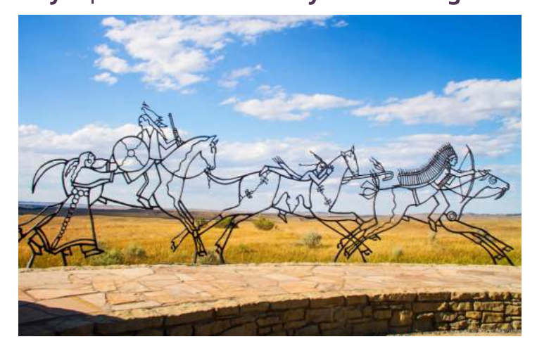
Day 8 | Unlock The History of Little Bighorn

Today on your US National Park tour, explore history and living traditions starting with a visit to Little Bighorn Battlefield National Monument, the battlefield where the ill-fated Custer led his men against a battalion of Sioux and Cheyenne warriors now known as Custer's last stand. From battlefields to the Black Hills, make your way to the base of Crazy Horse Memorial, an iconic monument representing the Oglala Lakota warrior 'Crazy Horse'. Admire the colossal carved face and learn about its origins during a walk-through of The Indian Museum of North America before arriving in Rapid City. Light up your night on an Optional Experience joining Mount Rushmore by Night with a Park Ranger. The sculpture lighting ceremony culminates as the faces of the monument are fully illuminated.