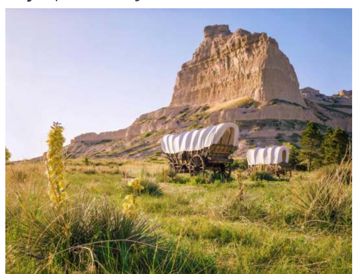
Day 4 | North to Jackson

Get ready for a change of scenery on your US National Park tour today, taking in views of Powder Mountain and southeast Idaho as you head north from Salt Lake City to Jackson. Standing in the shadows of the Teton Range's icy peaks, this mountain town has an Old West look with a modern twist. Get a feel for the outdoor vibe - home to three ski areas and many rugged trails on your own. Grab dinner this evening in one of the old-timey saloons and steakhouses destined to fuel your adventures through western frontiers.