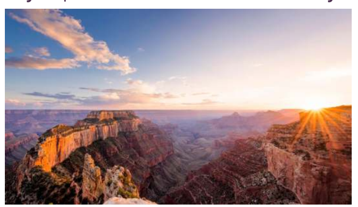
Day 14 | Tour the Remarkable Grand Canyon

Your big day of bucket list sites on your US National Park tour begins in Monument Valley. Enjoy a unique exploration with a Local Specialist driving in an open-air vehicle past its towering sandstone buttes and mesas that rise from the barren landscape on a MAKE TRAVEL MATTER® Experience. Continue through the ancestral home of the Navajo, winding along Desert View Drive, surrounded by mesmerising Multi-coloured depths. Stop at Desert View Intertribal Cultural Heritage Site to hear stories, family histories and cultural demonstrations by tribal members on another MAKE TRAVEL MATTER® Experience. We've saved the best for last: the Grand Canyon. Get a unique perspective from geological expert Canyon Tim who reveals the geological wonders on a private nature talk. Join your fellow travellers for a Farewell Dinner toasting to America's National Parks at your accommodations inside Grand Canyon National Park.